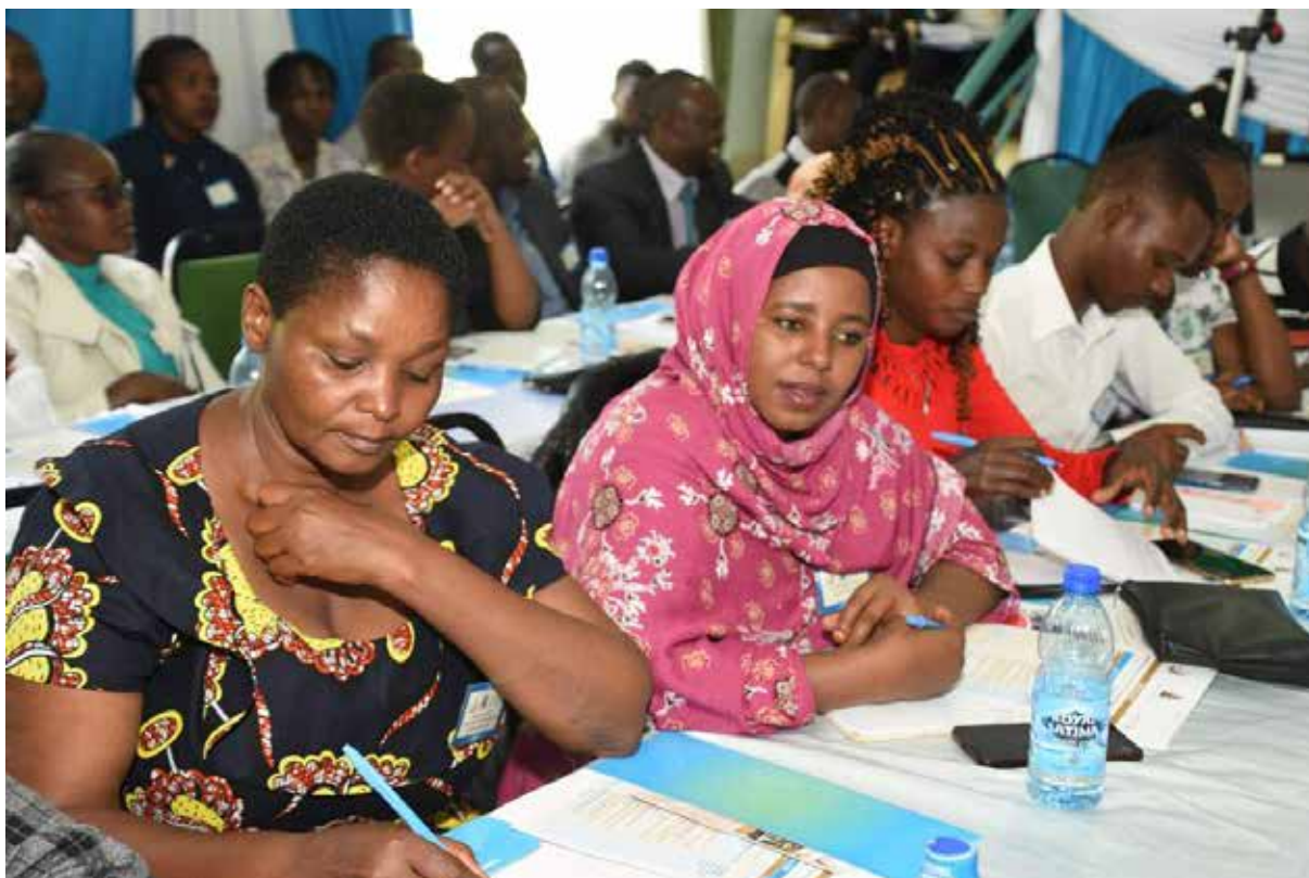
Participants listening to the presentations during the workshop