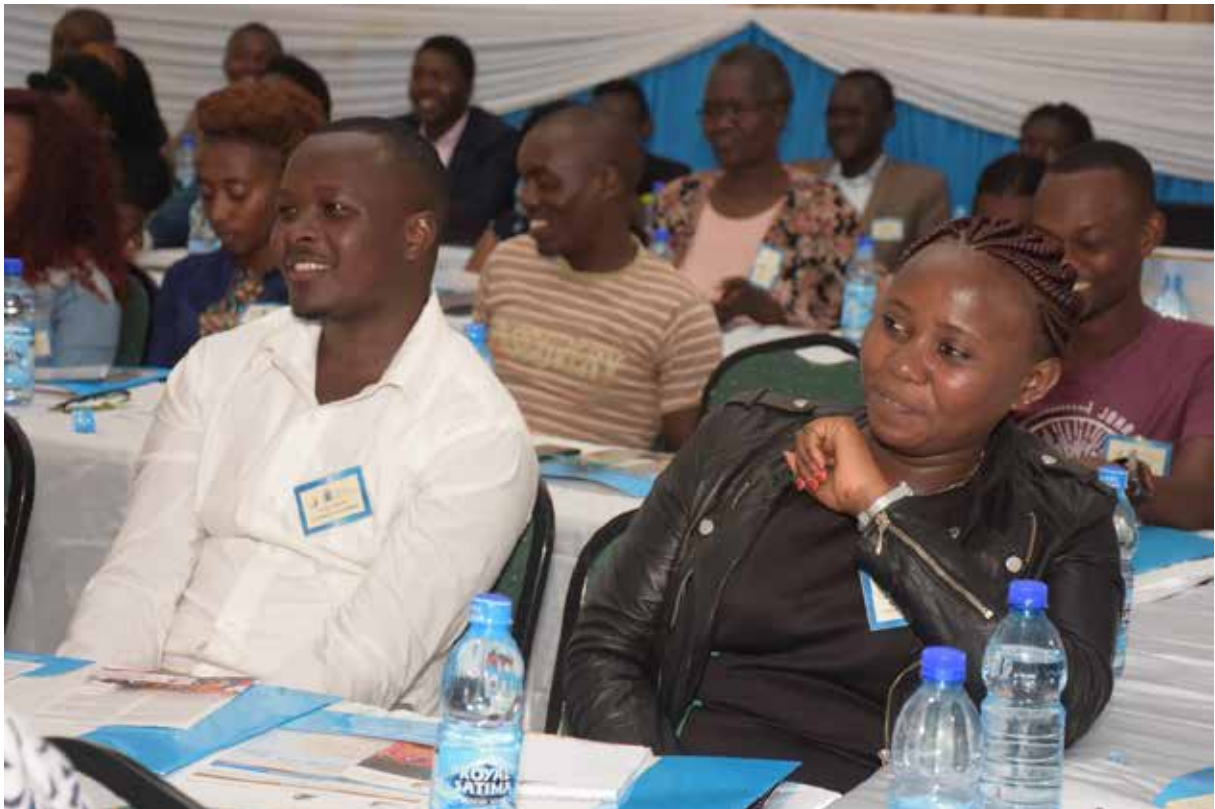
Participants listening to the speakers during the workshop