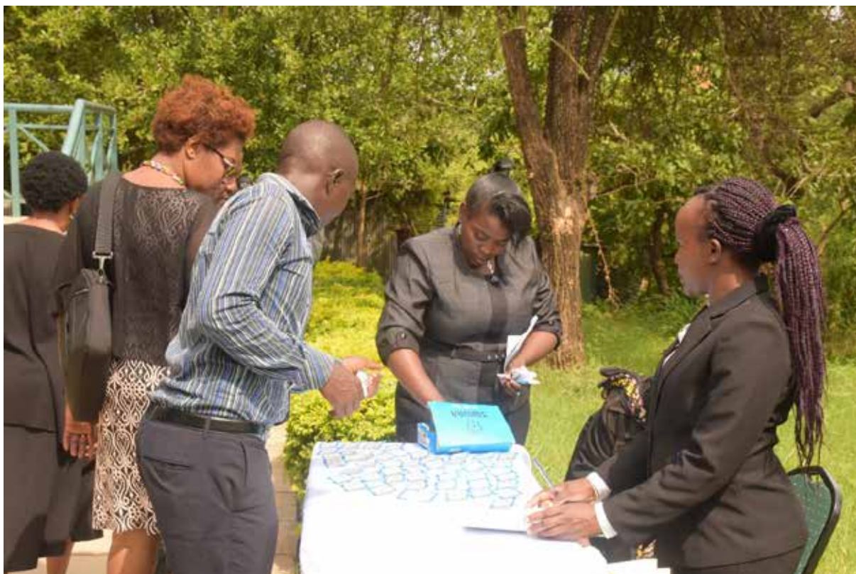
Participants being registered to attend the workshop