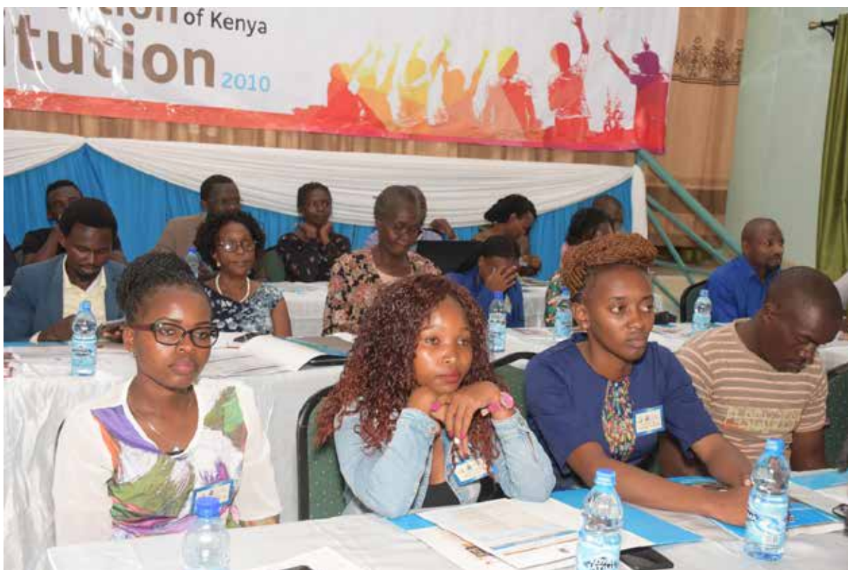
Young people attending the workshop listening to the speakers