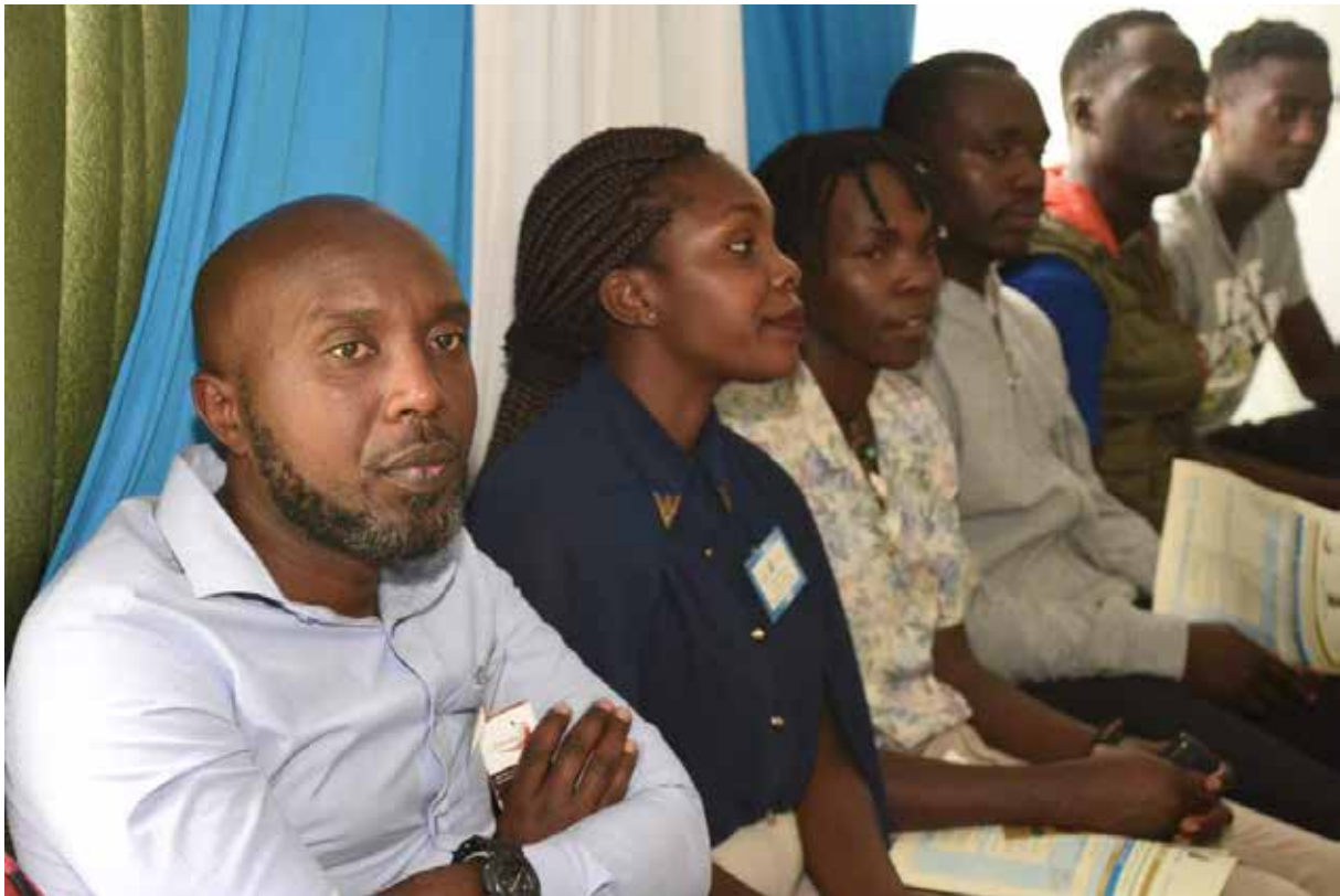
Participants listening to the presentations during the workshop