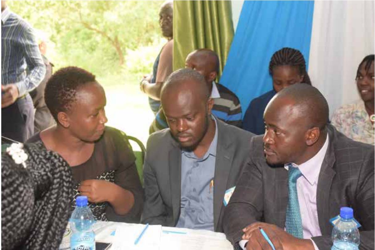
Participants from the County government of Makueni