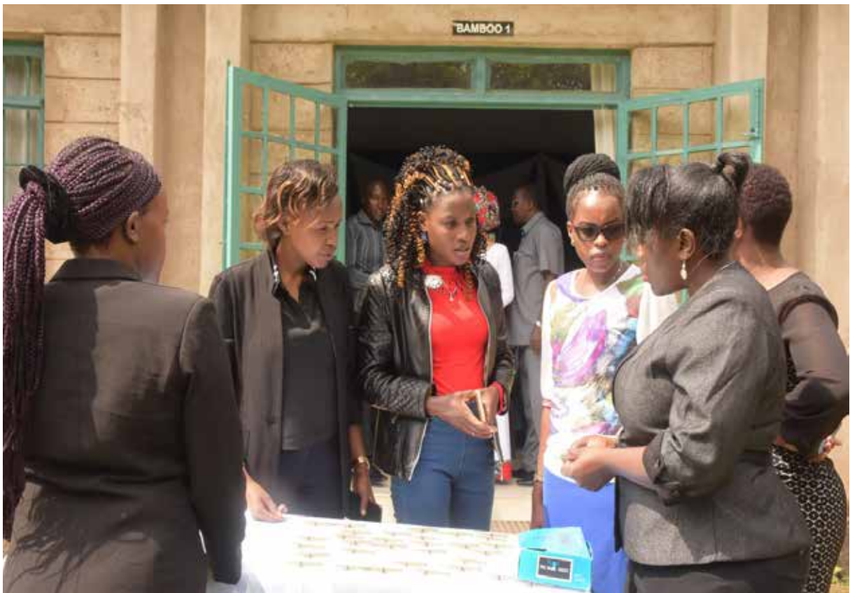
Participants being registered to attend the event