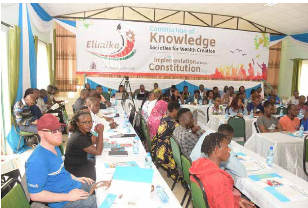
Participants during the workshop