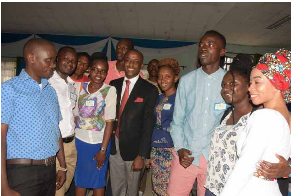
Hon. Mutula Kilonzo Jr., poses for a photo with the youth