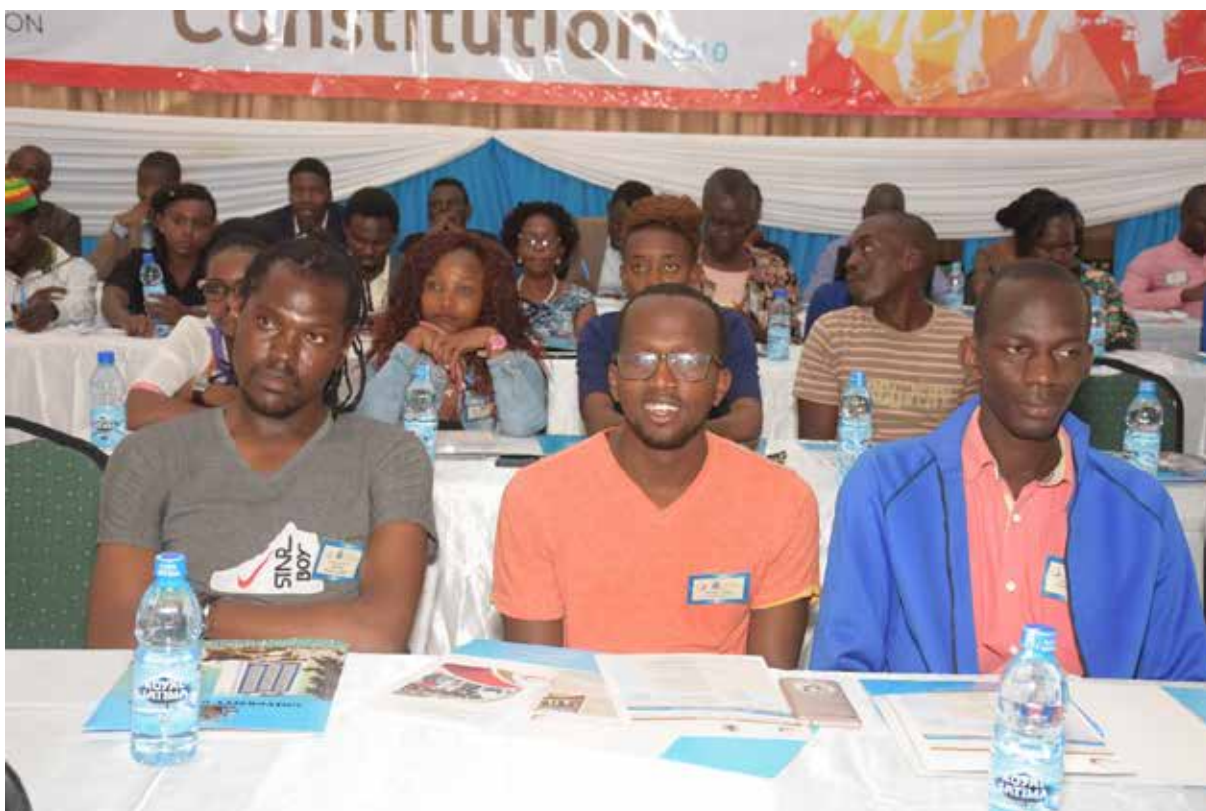
The youth listening to the presenters during the workshop