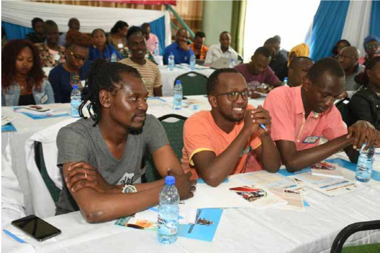
Youth participants during the workshop