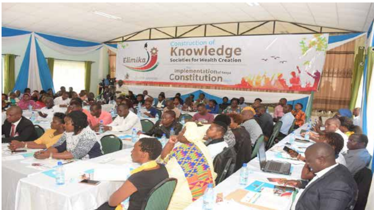
Participants during the workshop