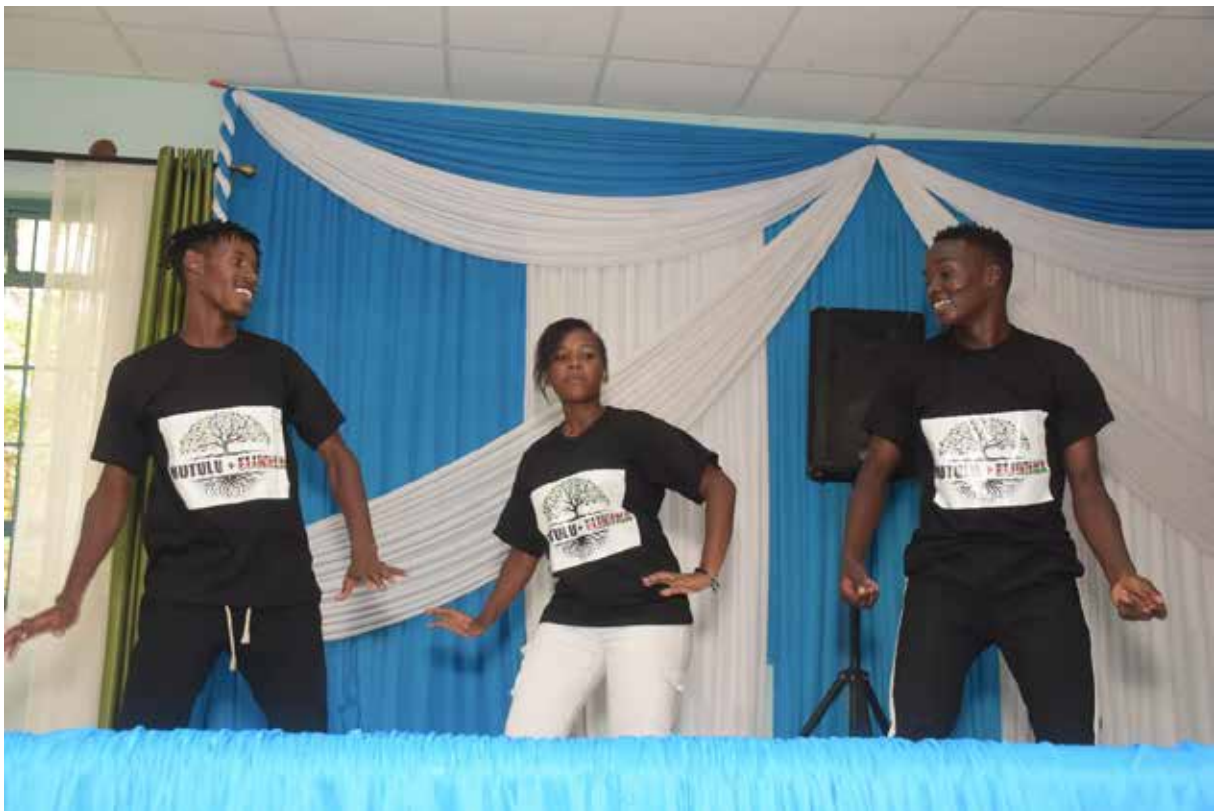
Dancers entertaining participants during the workshop